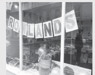
Pop up shop at 1 Tower Street

Saturday 2nd September - Rowland's will be taking 1 Tower Street POP UP Shop to promote our activities and Raise Funds, can you help, with Home Baking, or items for the Tombola or any other suggestions.(pop up pic)