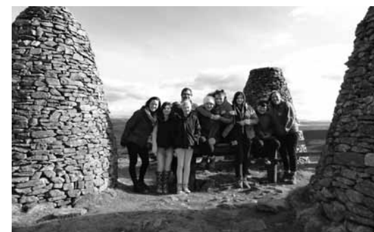
Raising funds and getting some fresh air at the 'The Three Brethren'

One of our goals for our 10th year is to offer a breakfast club, to encourage youngsters to get to school on time ready