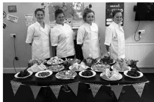
Making use of the kitchen.

With a fully equipped kitchen, computer room and three communal areas that are used for our own events, drop in sessions, drama and movie group and available for others in the community to use.